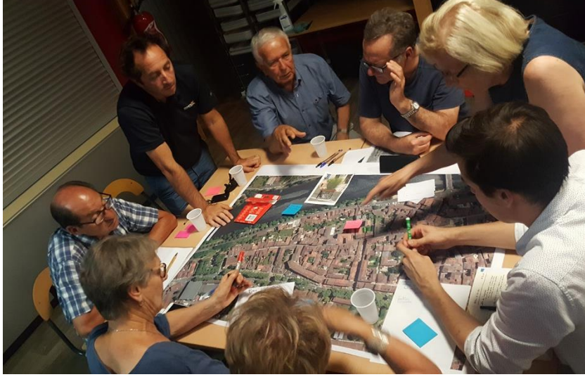
Workshop about what is wrong and what is right in the neighbourhood (summer 2018)