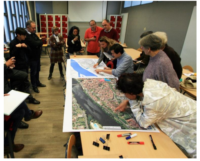
ULG meeting after the walking diagnostic, in October 2018