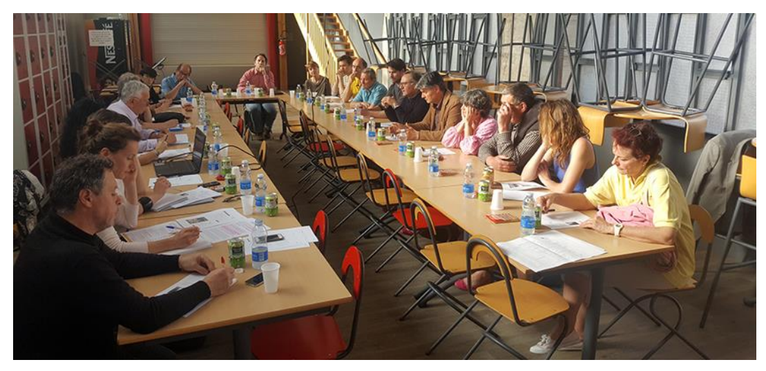
First meeting with Cahors ULG members

Thanks to the Int Herit network, and especially to the methodology worked during peer review and transnational meetings' workshops, we have been able to create our ULG, in particular to identify the actors who might be interested in participating in such a process.