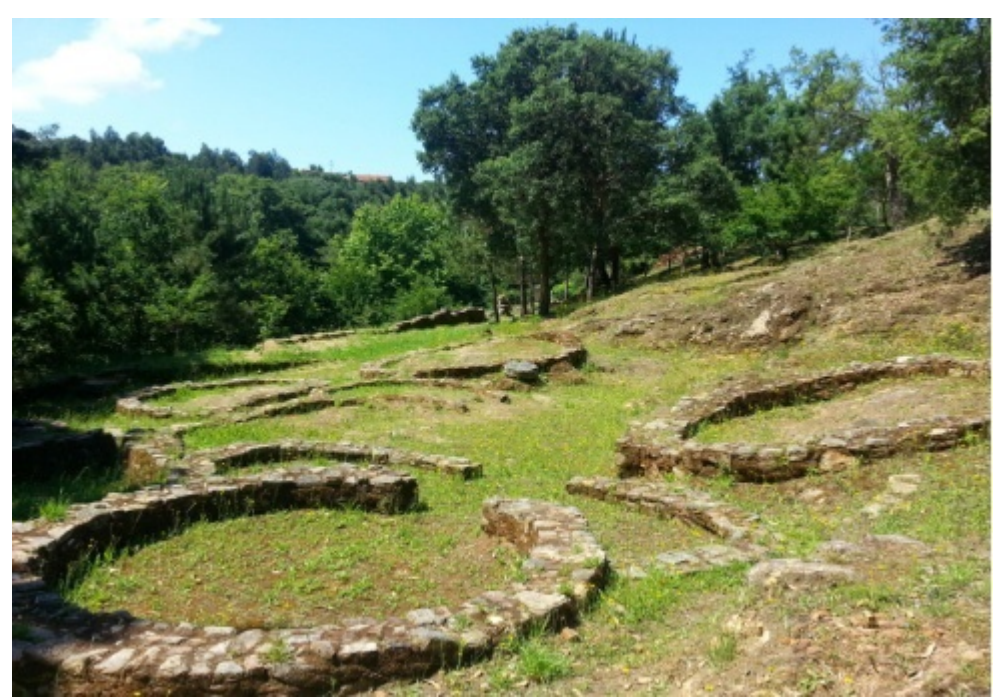
Figures 1,2 and 3 - Castro de Ovil before Intervention