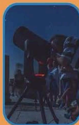
Observación astronómica con telescopio de alta gama Impartida por Antonio Becerra