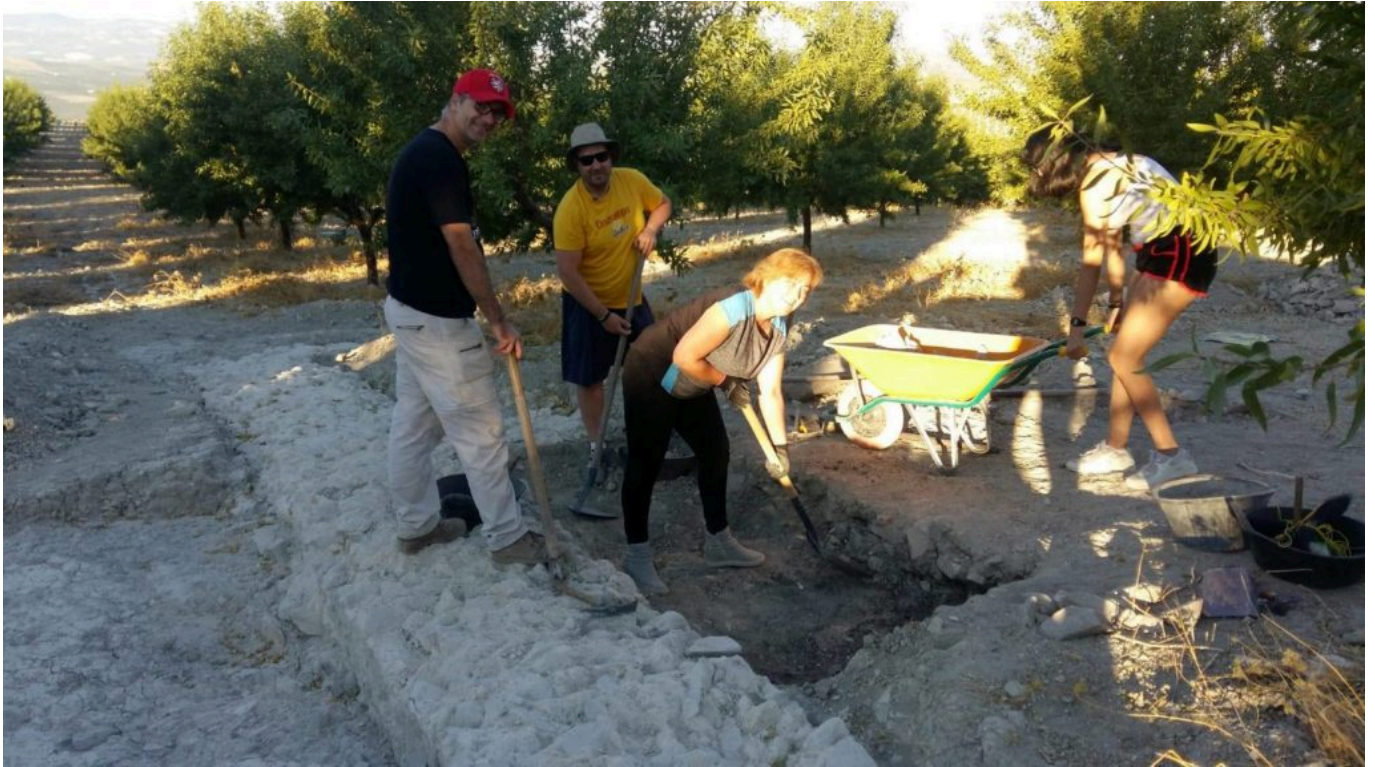
Work in progress in the Archaeological Park