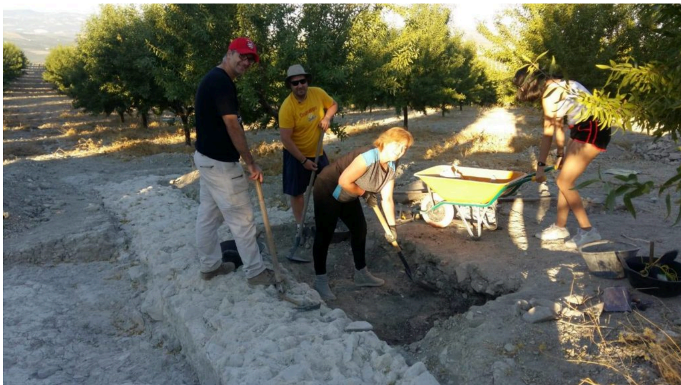
Work in progress in the Archaeological Park