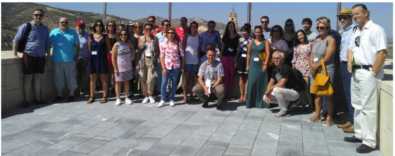
KoM Baena - Team INT-Herit

The INT-HERIT implementation network brings together a set of 9 small and medium-sized European cities around the common goal of revitalizing the local cultural heritage. In a context of crisis and institutional reorganization of local governments, the INT-HERIT cities are facing different challenges linked to the revitalization of cultural heritage. The network aims at implementing innovative models in the field of heritage management thanks to a set of integrated and sustainable local strategies. The URBACT Programme allows cities to learn from one another and to develop operational instruments for the implementation process of the local strategies.